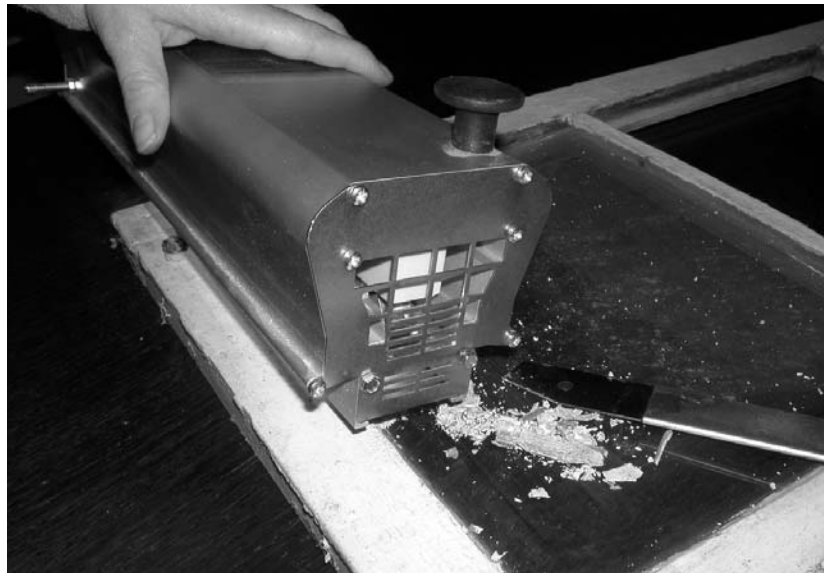
Figure 2 The putty lamp – an innovation by Sonja and Hans Allbäck.

We also found many useful hand tools and quality materials, including a hand-driven profile planer from the early eighteenth century. Even today we use this ‘machine’ to complement the work of modern machinery in renewing windows from that period (Figure 3).