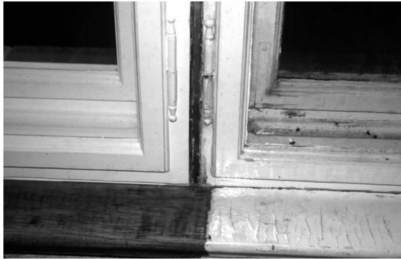
Figure 5 Window from 'Kastenfenster' in Leipzig dating from 1880.

completely removed. The outer and inner frames were fitted together and minor damage caused during transportation was repaired. After impregnation with raw linseed oil, the windows were re-glazed using linseed-oil putty of our own manufacture. Our goal was to keep the milled glass in the outer casements. As an experiment, we used 3 mm Pilkington Kappa Energy glass (K-Glass) in one of three inner casements, in order to show the differences in colour and light. Nobody noticed the difference.